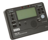
Tuner/Metronome Combo (Recommended model: Korg TM-60)

All of the percussion accessories can be purchased from the Lonestar Percussion store . They specialize in percussion instruments and accessories. They are located at 10611 Control Place, Dallas, TX 75238. They also have an online store – www.lonestarpercussion.com .