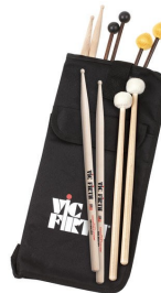
Vic Firth EP2 Intermediate Education Mallet Pack